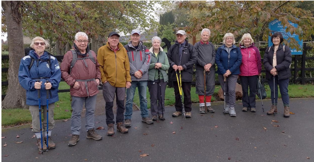
Ready for the off

On a foggy morning 11 walkers started out from Sutton Cheney for a 5 mile walk. Beginning on the road and then into the fields towards Bosworth Battlefield, where we walked down the entrance road and then on into fields coming out on the lane leading to Market Bosworth. From there we made our way to the park, walked around the pond and out to fields beyond, then back to Sutton Cheney.